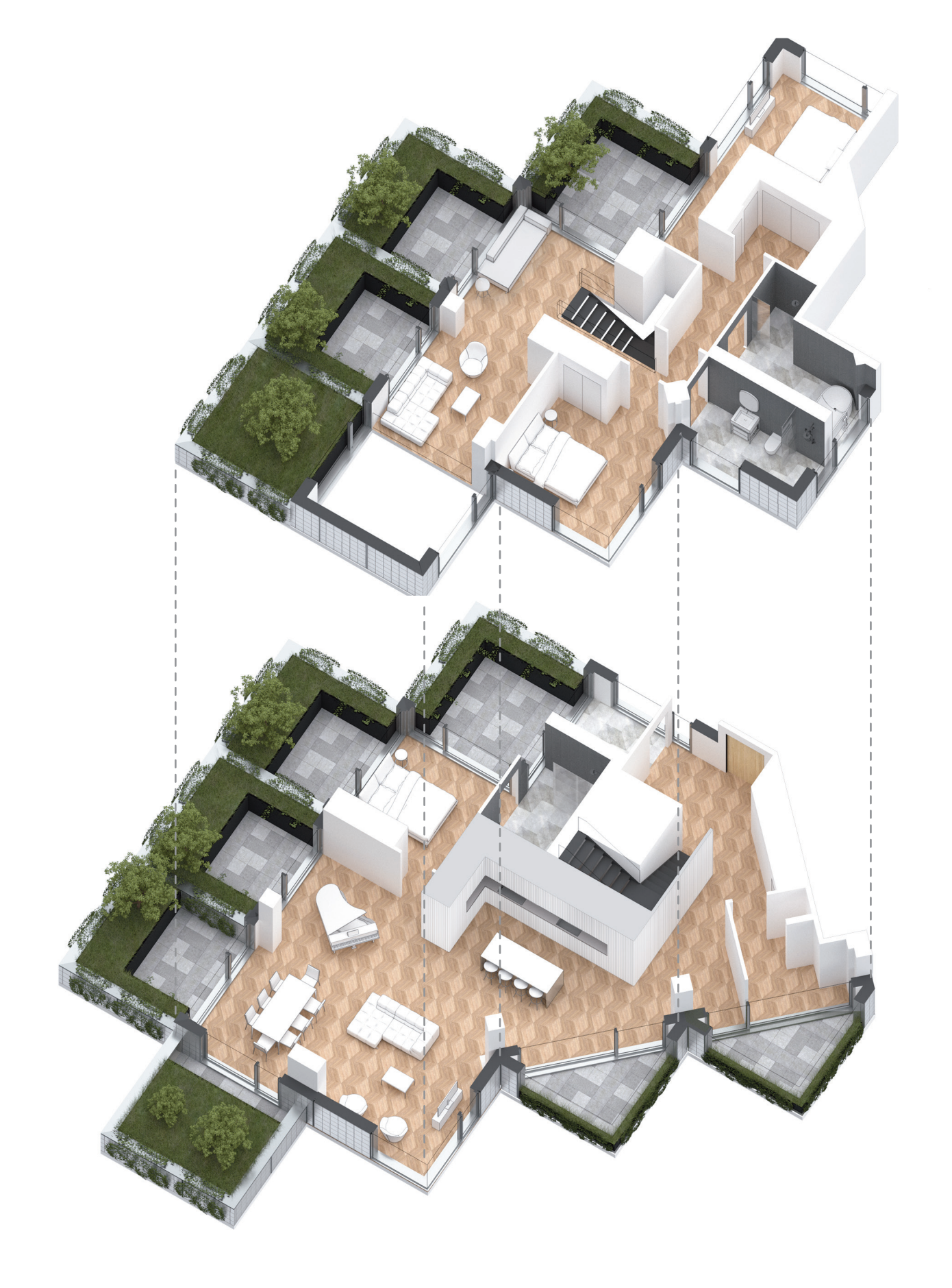
All dimensions and specifications are approximate. Certain plans are reverse or mirror image. Balcony square footages are estimated and may vary from that stated. Please see Sales Representative for details. Furniture not included. Refer to key plan for unit location and orientation. E. & O.E.